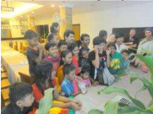
Kids watchig the video of the previous week at ODA See ODA Art Facebook for the video.

Gold coin donation at door...bring your friends & everyone- kids – grandparents - dogs – you name it they're welcome!!