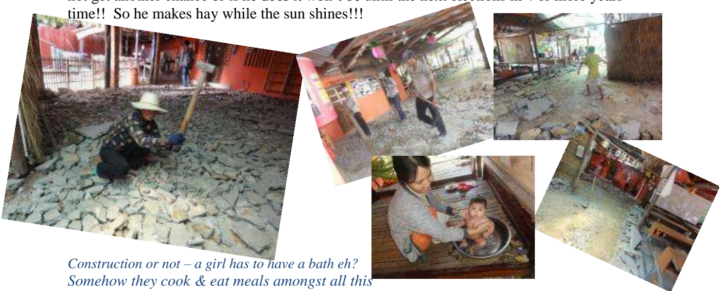
Construction or not – a girl has to have a bath eh? Somehow they cook & eat meals amongst all this